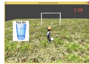
Figure 6. Game show glass of water icon, while he playing football