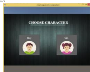
Figure 1. Player choose character