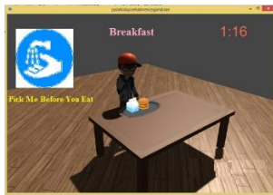
Figure 3. Home Environment, Morning theme

before they pick up their food for breakfast. There is icon wash hand appear on the top left side to remain player, they need to wash their hand before choose food and drink, which can be seen in Figure 3. If the player click icon wash hand first before choose food, then player got "hand washing reward", but they click food or drink first then icon wash hand they won't have any reward. At the Morning and noon theme, game appear home environment and at the daylight theme game will appear school environment which is school canteen, as seen in Figure 4.