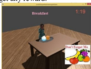
Figure 5. Game remain fruit and vegetable to player