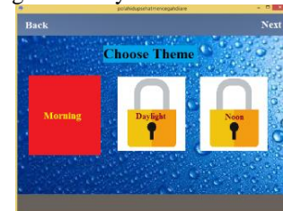
Figure 2. Player choose theme