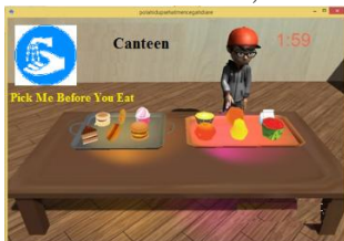
Figure 4. Canteen Environment, daylight theme