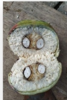
Figure 4 Bintaro seed