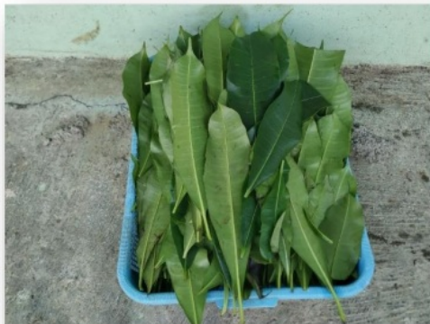
Figure 1 Bintaro leaves