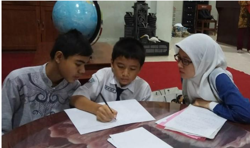
Figure 1. the process of collecting data 1

intersect the sides of a triangle. (5) The student draws a line, which is the intersection of two circles vertices of the triangle with the run. The lines formed derived from the vertex intersection of the circular arc side wedge and in front of the triangle. (6) students can explain the characteristics of the lines that lie in the triangle from start to finish drawing.