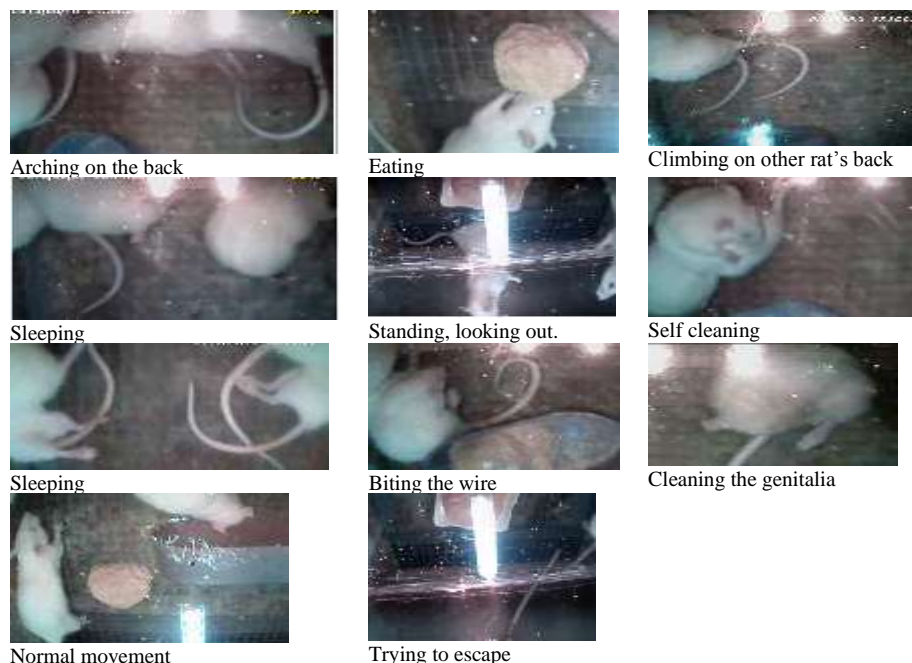
Figure 1. Rats' behaviour on CCTV.

The recordings used as data sources were made for seven days. This was enough time to cover one estrous cycle, which ended on the day that blood serum samples and vaginal smears were taken. The results of the observations are shown in Table 1. Some examples of rat behavior that falls into the categories of sexual and general behavior are shown in Figure 1.