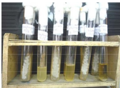
Figure 2. Pure microbial isolate

Pure microbial cultures obtained from the Inter-University Center for Food and Nutrition, University of Gajah Mada (PAU Food and Nutrition UGM) are Staphylococcus aureus FNCC 0047, Pseudomonas fluorescens FNCC 0070, and Saccharomyces cereviceae FNCC 3012. Pure microbial isolate can be seen at Figure 2.