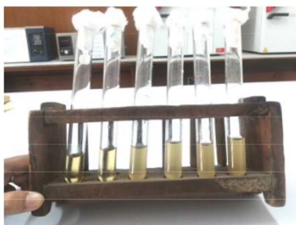
Figure 4. Result of minimum inhibition concentration test

Pseudomonas fluorescens , and Saccharomyces cereviceae .