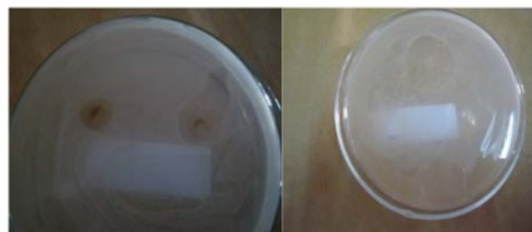
Figure 3. Inhibition zone of “ tutup ” plant leaves and flowers

The results of antimicrobial activity test with two factors, namely the part of the plant (S) and concentration (K) can be seen at Figure 3 and Table 1.