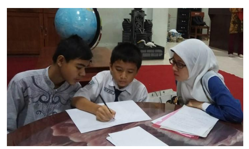
Figure 1. the process of collecting data 1

intersect the sides of a triangle. (5) The student draws a line, which is the intersection of two circles vertices of the triangle with the run. The lines formed derived from the vertex intersection of the circular arc side wedge and in front of the triangle. (6) students can explain the characteristics of the lines that lie in the triangle from start to finish drawing.