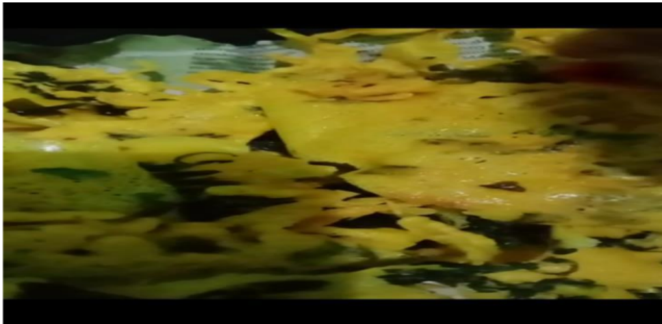
Fig 2. Processed clover

The processed clover that was distributed was how to make cilok, nuggets and peanut brittle, with the hope that PKK cadres were able to apply it as an alternative food that could be sold, in addition to using abandoned rice fields. So as to be able to open new innovative business opportunities to become economically independent families and be able to rise during the COVID-19 pandemic conditions which made many people experience the impact.