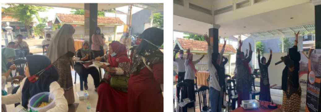
Fig 3. Training & Mentoring Activities

The processed clover that was distributed was how to make cilok, nuggets and peanut brittle, with the hope that PKK cadres were able to apply it as an alternative food that could be sold, in addition to using abandoned rice fields. So as to be able to open new innovative business opportunities to become economically independent families and be able to rise during the COVID-19 pandemic conditions which made many people experience the impact.