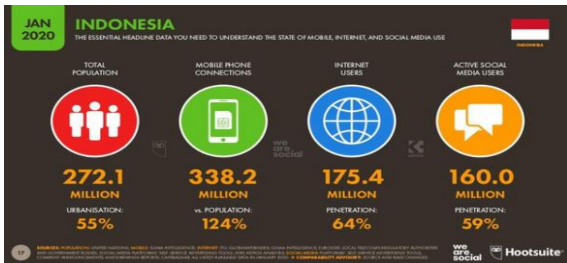
Figure 1. Number of Indonesian internet users in 2020

Based on the latest We Are Social report, in 2020 it was stated that there were 175.4 million internet users in Indonesia. Compared to the previous year, there was an increase of 17% or 25 million internet users in this country. Based on the total population of Indonesia, which is 272.1 million people, it can be calculated that it means that 64% and half of Indonesia's population has experienced access to cyberspace. Percentage of internet users aged 16 to 64 years who own each type of device, including mobile phones (96%), smartphones (94%), non-smartphone mobile phones (21%), laptops or desktop computers (66%), tablets (23%), game consoles (16%), to virtual reality devices (5.1%).