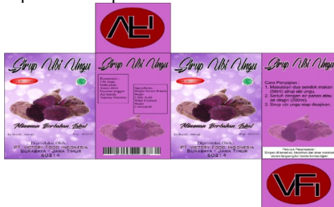
Figure 3. Secondary Packaging

The primary packaging is called because the packaging is directly in contact with the product. Examples of primary packaging are glass bottles, tubes and caps. Purple sweet syrup uses label paper and glass bottles because the primary packaging is not in direct contact with the product. Primary packaging is very important in terms of its function, namely to protect (protection), preserve (preservation), communication to the customer (communication), and include artistic functions so that consumers who see are interested in buying. Whereas in the packaging bottle the sterilization process is carried out before use, then filling or filling is carried out and if there is permeation, the bottle cap must be replaced.