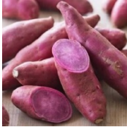
Figure 1. Purple Sweet Potato

Sweet potato or sweet potato ( Ipomoea batatas ) is a type of cultivated plant. The part that is used is the roots that form tubers with a high source of carbohydrates and calories. Purple sweet potato is one of the food crops that can grow and develop in Indonesia, as the fourth highest source of non-rice carbohydrates after rice, corn, and cassava. Purple-based foods in ancient times were better known as poor food substitutes for rice. The purple cassava is only boiled and fried. But now they are able to disguise the food made from purple sweet potato into a classy and quality food.