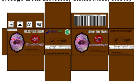
Figure 4. Tertiary Packaging For 12 bottles

Secondary packaging is needed to protect the primary packaging during storage in the warehouse, during transportation, and when distributed to large party customers and retail customers. Secondary packaging is also to anticipate transportation modes and road conditions in the distribution system. In products with primary packaging using flexible materials, secondary packaging is often needed to protect the product and its primary packaging. Example: purple yam syrup packaging uses a glass bottle primer that does not have the power to protect itself from outside forces. Therefore, they need the help of secondary packaging, namely 1 bottle box during transportation storage from factories, distributors, stores, until it reaches consumers.