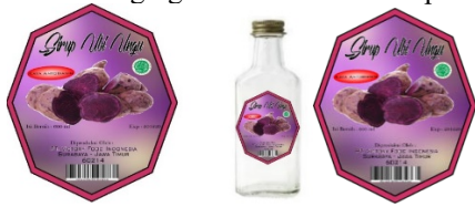
Figure 2. Primer Packaging

The primary packaging is called because the packaging is directly in contact with the product. Examples of primary packaging are glass bottles, tubes and caps. Purple sweet syrup uses label paper and glass bottles because the primary packaging is not in direct contact with the product. Primary packaging is very important in terms of its function, namely to protect (protection), preserve (preservation), communication to the customer (communication), and include artistic functions so that consumers who see are interested in buying. Whereas in the packaging bottle the sterilization process is carried out before use, then filling or filling is carried out and if there is permeation, the bottle cap must be replaced.