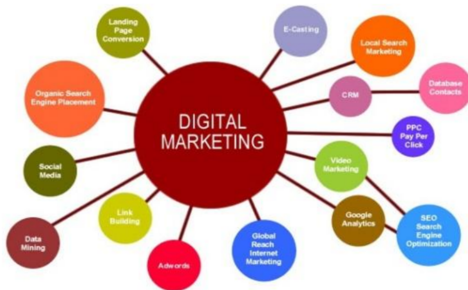
Fig.1: Digital Marketing

Additionally, net offers some valuable selections for reducing the value of the various marketing strategies that's becoming further necessary among the presence of world-wide finical and financial condition. The main analysis focus of this piece of writing is prepared on work recent trends and developments in net marketing. The appliance of net as fully totally very distinctive business tool created completely new approaches for doing business referred to as net or on line marketing.