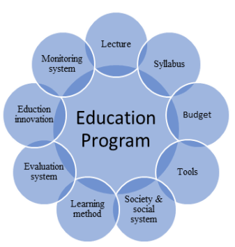
Fig. 1: Management of entrepreneurship class as education program (3).