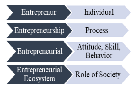
Fig. 2: Terminology of entrepreneur (4).