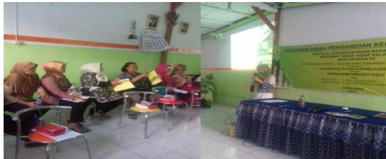
Figure 1-2: Outreach activities.

Documentation of extension activities can be seen in the following figure: