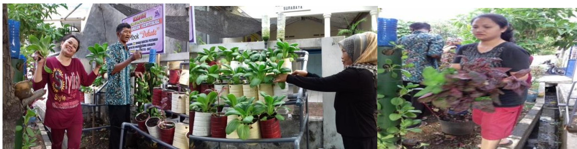
Figure 19–21: Harvest Activities

Harvest time is a joyful time, and it is what the cadre mothers have been waiting for a long time. Mothers harvest their crops with enthusiasm and joy. Seeing how their cultivation has yielded positive and successful results, the cadres are becoming more motivated to continue this activity in the future.