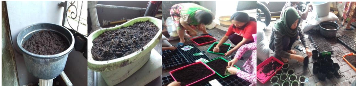
Figure 7-10: Nursery

Nurseries are carried out using used items such as bathtubs, buckets, slops, aqua glasses, etc. as shown below: