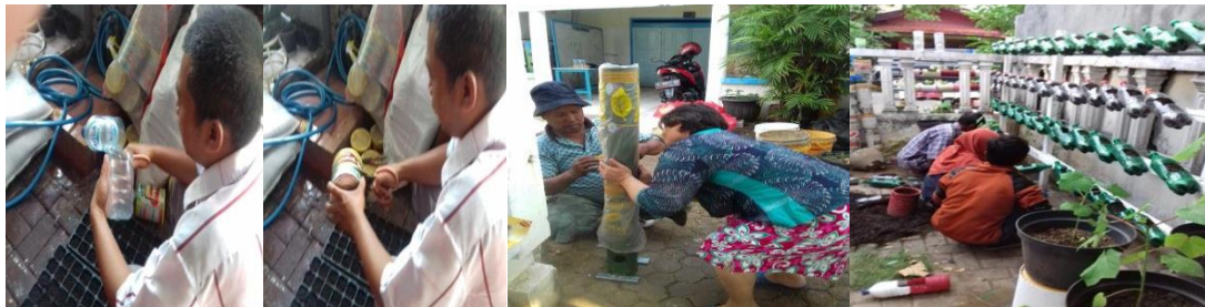
Figure 11-14: Planting.

After the seeds are three weeks to one month old, transplanting is carried out where the plants have been prepared vertically using used bottles, used cans, used paralon, etc. Planting activities can be seen in the following figure: