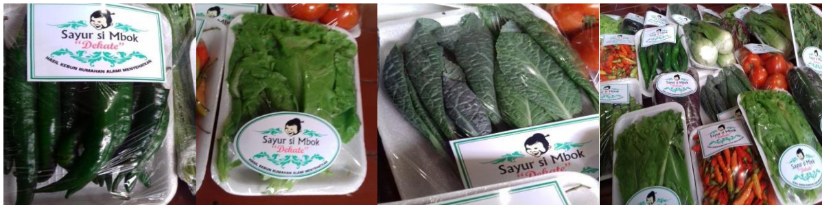
Figure 22 – 25: Labeling and packaging

products. The various post-harvest activities that are carried out eventually impact the selling value. The production results from post-harvest activities are depicted in the diagram below.