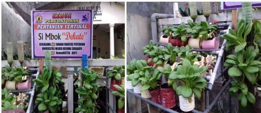
Figure 15–18: Plant maintenance