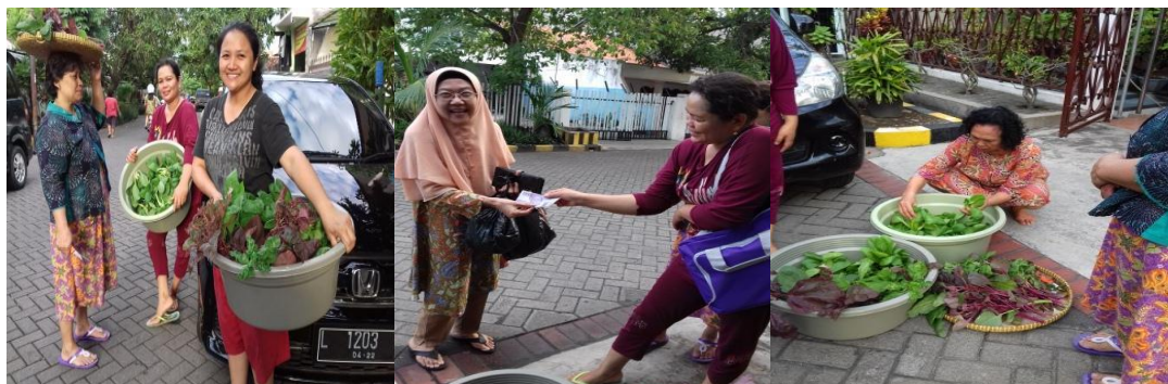
Figure 26–28: Product marketing activities

The target is Community Service activity, among others, is the emergence of entrepreneurship from the cadres, manifested by their passion for selling. As the cadres did initially sell products door to door to homes, this received a satisfying response because mothers did not have to go far to the market to get vegetables that were still fresh and had been harvested at a lower price. The following is a picture of door-to-door sales.