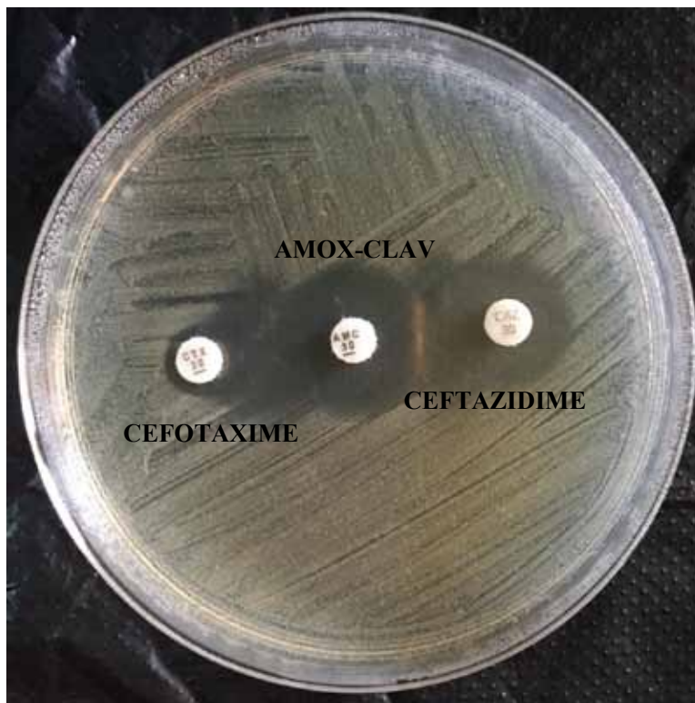
Figure 2. Confirmation of ESBL by Double Disc Synergy Test (DDST)

meropenem were also noted and can be explained by the absence of routine use of amikacin as empirical therapy on poultry farms and the absence of sufficient cross resistance with the beta-lactam antibiotic group.