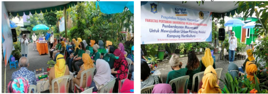
Figure 4 Counseling

Documentation of counseling activities can be seen in the following figure: