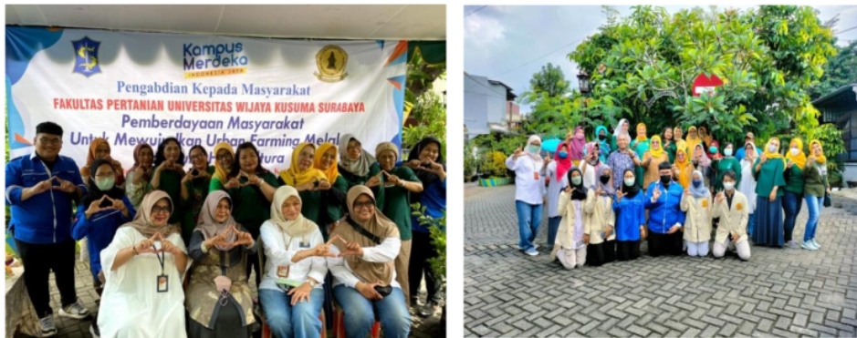
Figure 7 The togetherness of the Implementation Team and the Community.