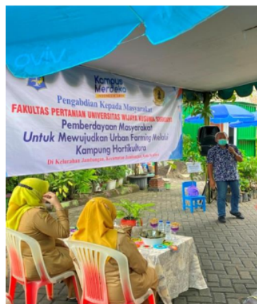
Figure 3 Briefing of the Vice-Chancellor I of UWKS