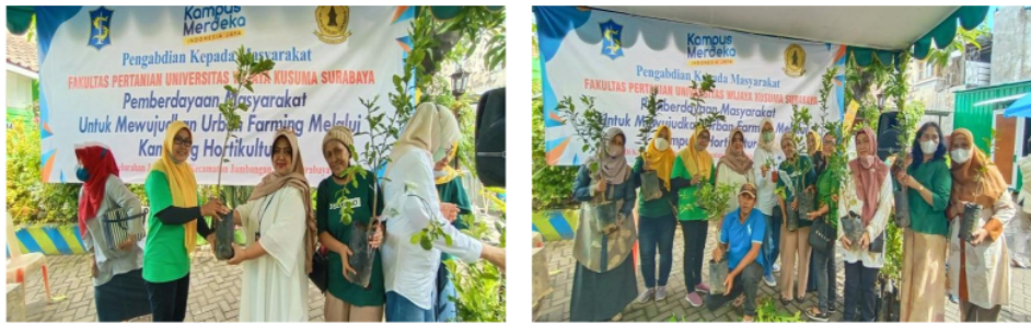
Figure 5 Giving Productive Crop Grants