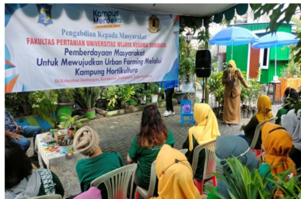
Figure 2 Briefing by Headman of Jambangan Sub-district

The following is documentation in order to foster community motivation.