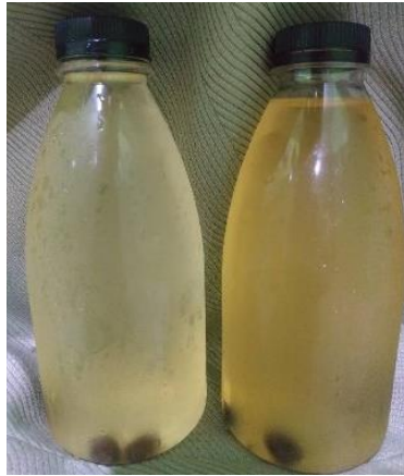
Picture 1. Kefir of Keji beling tea (a. Concentration 10%, b. Concentration 15%)

K4= Concentration of keji beling tea 15% and duration of fermentation 24 hours.